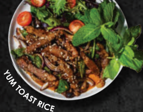
YUM TOAST RICE